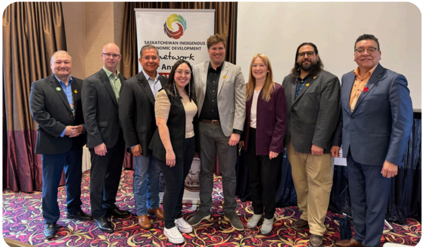
SIEDN Team at the 2024 Indigenous Economic Development Day luncheon

SEDA and partner Saskatchewan Indigenous Economic Development Network (SIEDN) work together each year to raise awareness for the efforts of economic development professionals, leaders and their organizations in fostering sustainable and vibrant communities.